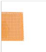
Grid-Style PC Board with 750 Holes